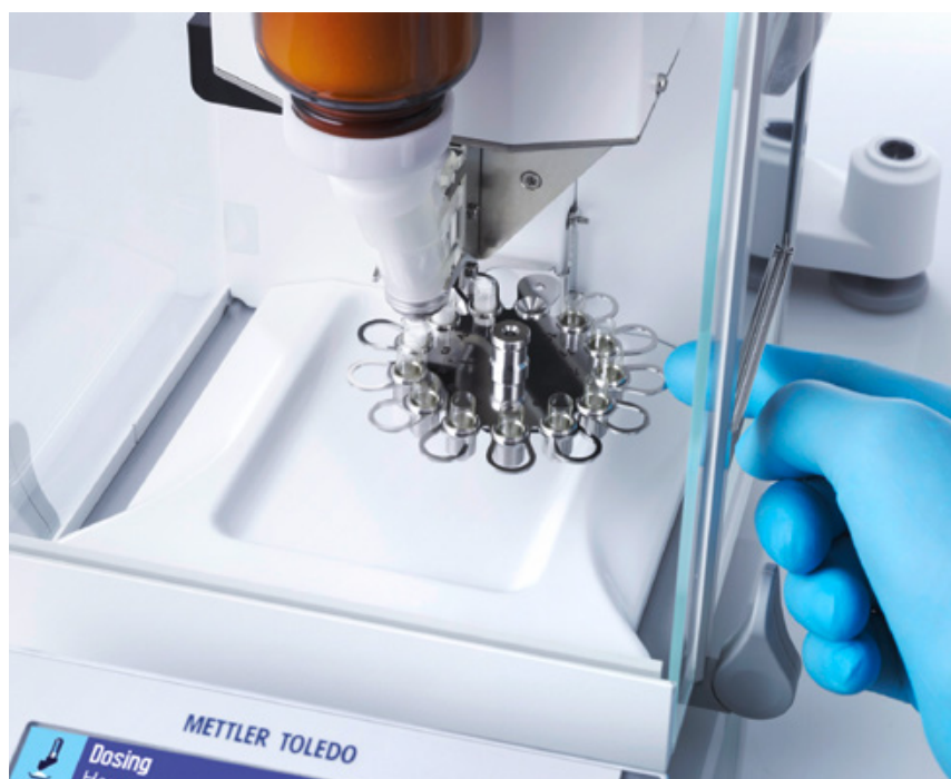
Fig. 1 Quantos in 1:12 configuration with Ergodisc (semi-automated)